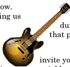
Gospel Singing Group to “sing” the Sermon!